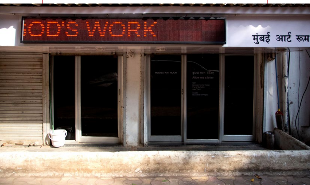
Birender Kumar Yadav, Government Work Is God's Work , 2017. LED light installation projected onto the entrance of the Mumbai Art Room.