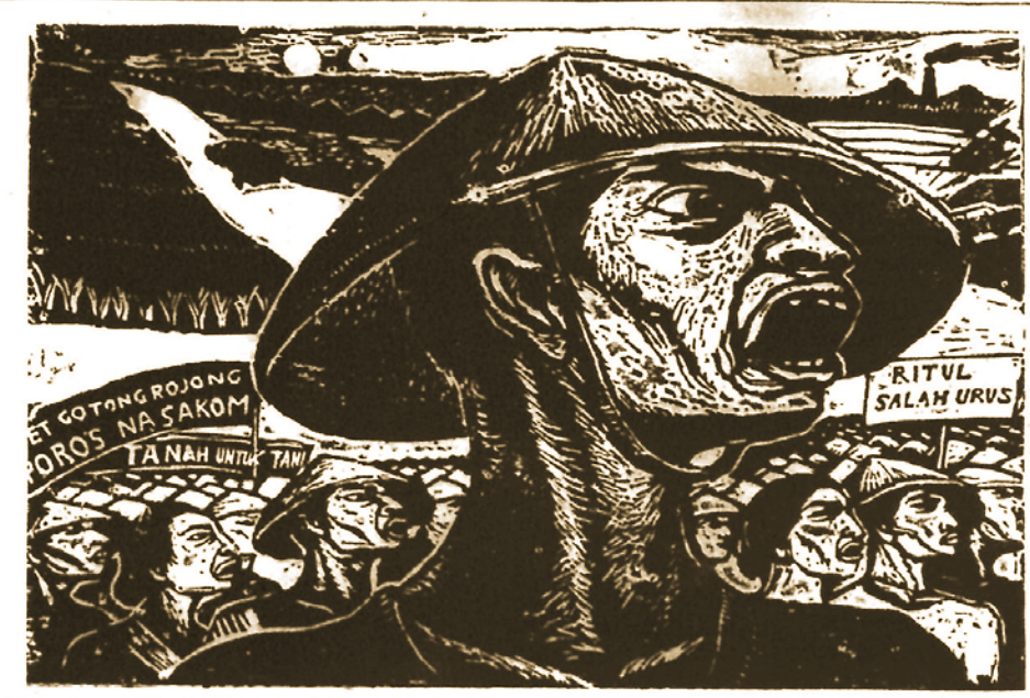
TANAH UNTUK PENGGARAP -