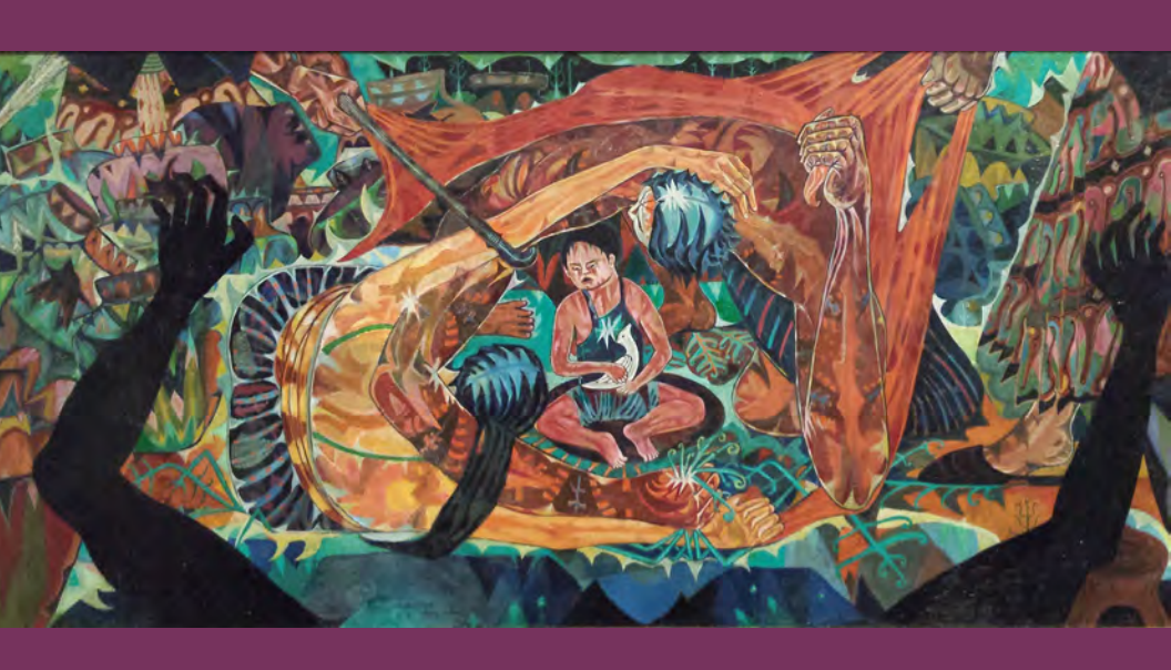
Amrus Natalsya, Mereka Yang Terusir Dari Tanahnya ('Those Chased Away from Their Land'), 1960, oil on canvas, 80 x 187 cm, Collection of National Gallery Singapore.