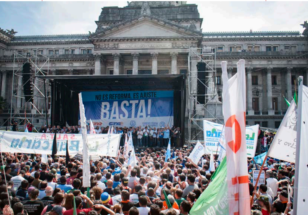
Bárbara Leiva/Patria Grande