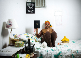
Western State, Home A 19-year-old person who migrated that night, posthumously. It is as if the person on the road in these caravans or on the boats in the Mediterranean Sea are to be pitied (if you are a person of sensitive disposition) or hated (if you are a person who has forgotten what it means to be human). But the people walking or on the boats are not without their own capacities and energy, without their own sense of what they are doing and why they are doing it.