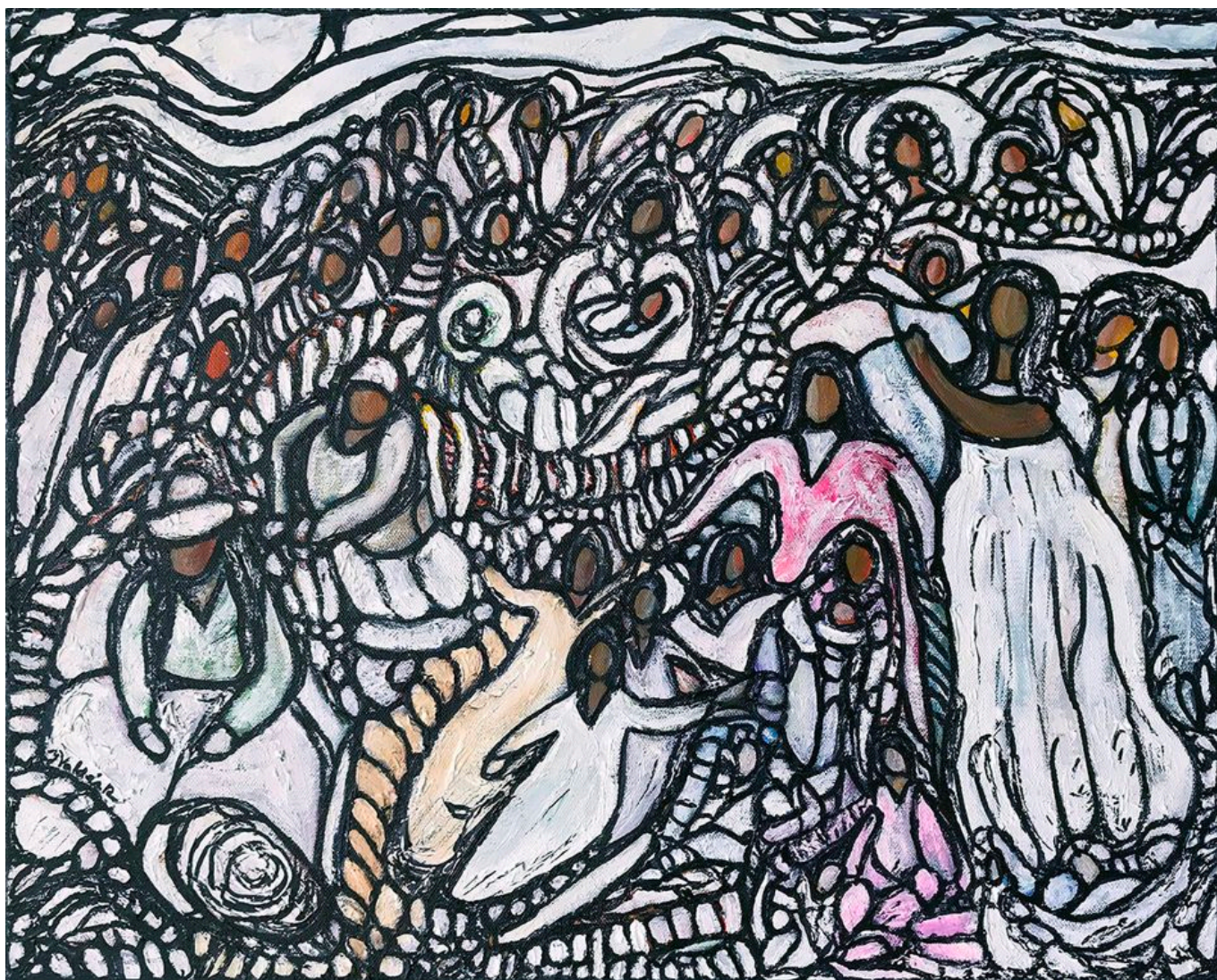
Yolanda Váldes Rementería (Mexico), Diversidad ('Diversity'), 2009.

The world food market was already stressed before the conflict in Ukraine, with prices going up during the pandemic to levels that many countries had not seen before. However, the war has almost broken this weakened food system. The most significant problem is in the world fertiliser market, which was resilient during the pandemic but is now in a crisis: Russia and Ukraine export 28% of nitrogen and phosphorus fertiliser as well as 40% of the world's exports of potash, while Russia by itself exports 48% of the world's ammonium nitrate and 11% of the world's urea. Cuts in fertiliser use by agriculturalists will lead to lower crop yields in the future unless farmers and farm companies are willing to switch to biofertilisers . Due to the uncertainty of the food market, many countries have established export restrictions, which further exacerbates the hunger crisis in countries that are not self-sufficient in food production.