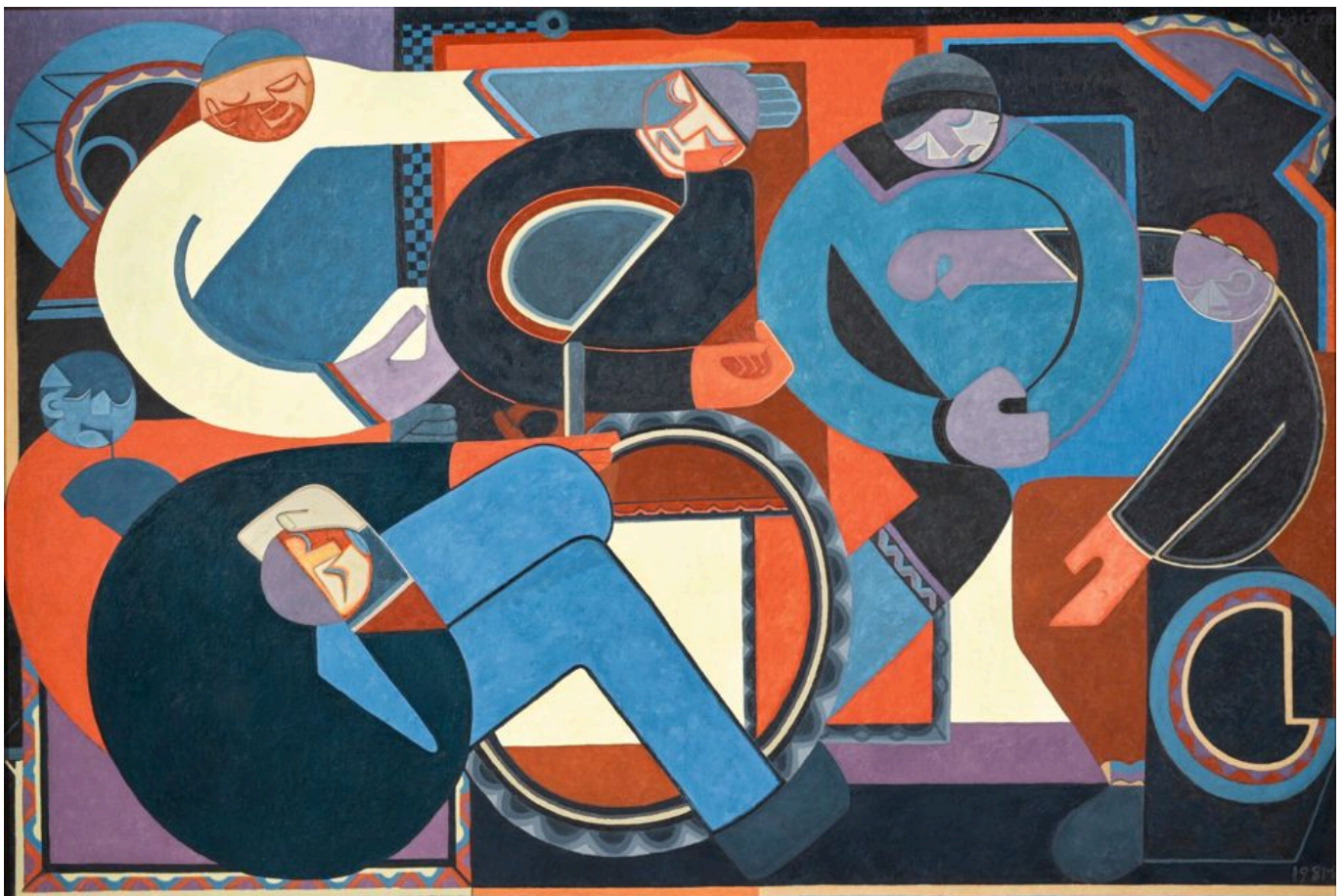
Uzo Egonu (Nigeria), Stateless People, An Assembly , 1982.

In these crisis-hit countries, food aid has come from governments and the UN's World Food Programme (WFP). Millions of refugees in these countries are almost entirely reliant upon UN agencies. The WFP provides ready-to-use therapeutic food, which is a food paste made of butter, peanuts, powdered milk, sugar, vegetable oil, and vitamins. Over the next six months, the cost of these ingredients is projected to rise by up to 16%, which is why on 20 June, the WFP announced that it would cut rations by 50%. This cut will impact three of every four refugees in East Africa, where about five million refugees live. 'We are now seeing the tinderbox of conditions for extreme levels of child wasting begin to catch fire', said UNICEF Executive Director Catherine Russell.