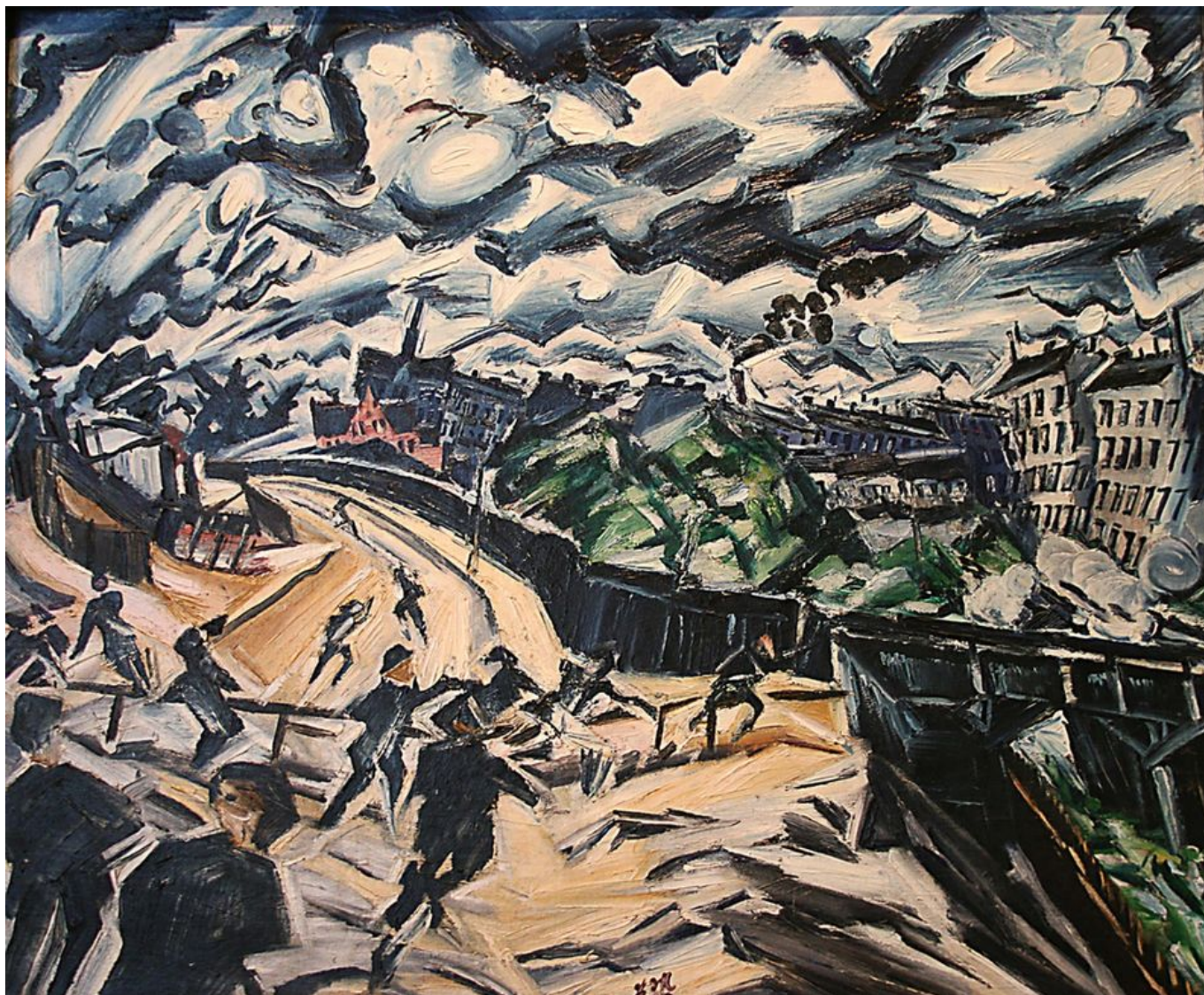
Ludwig Meidner (Germany), Apocalyptic Landscape , 1913.