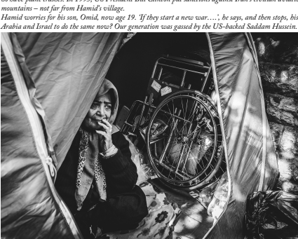
Old woman at Shariati Hospital, 1 Chran, 2016.