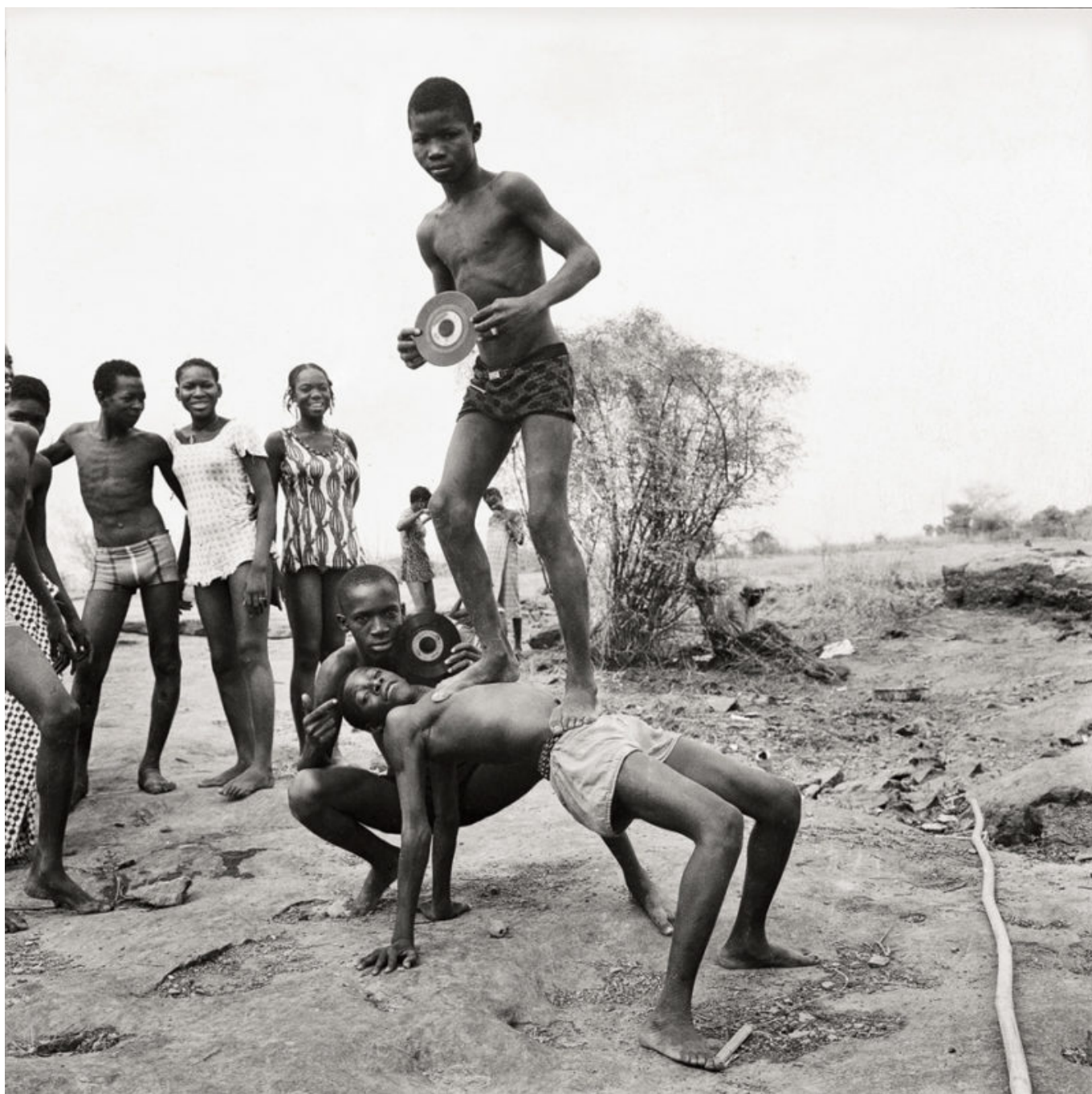
Malick Sidibé (Mali), Pique-nique à la Chaussée ('Picnic on the Roadway'), 1972.

This is not the first time that Mali has pushed aside France to develop an independent national project. In 1960, Mali won its independence, and President Modibo Keïta led the country in its pursuit to establish sovereignty and contribute to the development of a pan-Africanist politics for the continent. In 1968, General Moussa Traoré left the barracks and overthrew the socialist government of Keïta. The overthrow of Keïta was not singular; the coup in Mali was part of a string of military coups on the continent, from Burundi (against Louis Rwagasore in 1961) and the Democratic Republic of Congo (against Patrice Lumumba in 1961) to Togo (against Sylvanus Olympio in 1963) and Ghana (against Kwame Nkrumah in 1966).