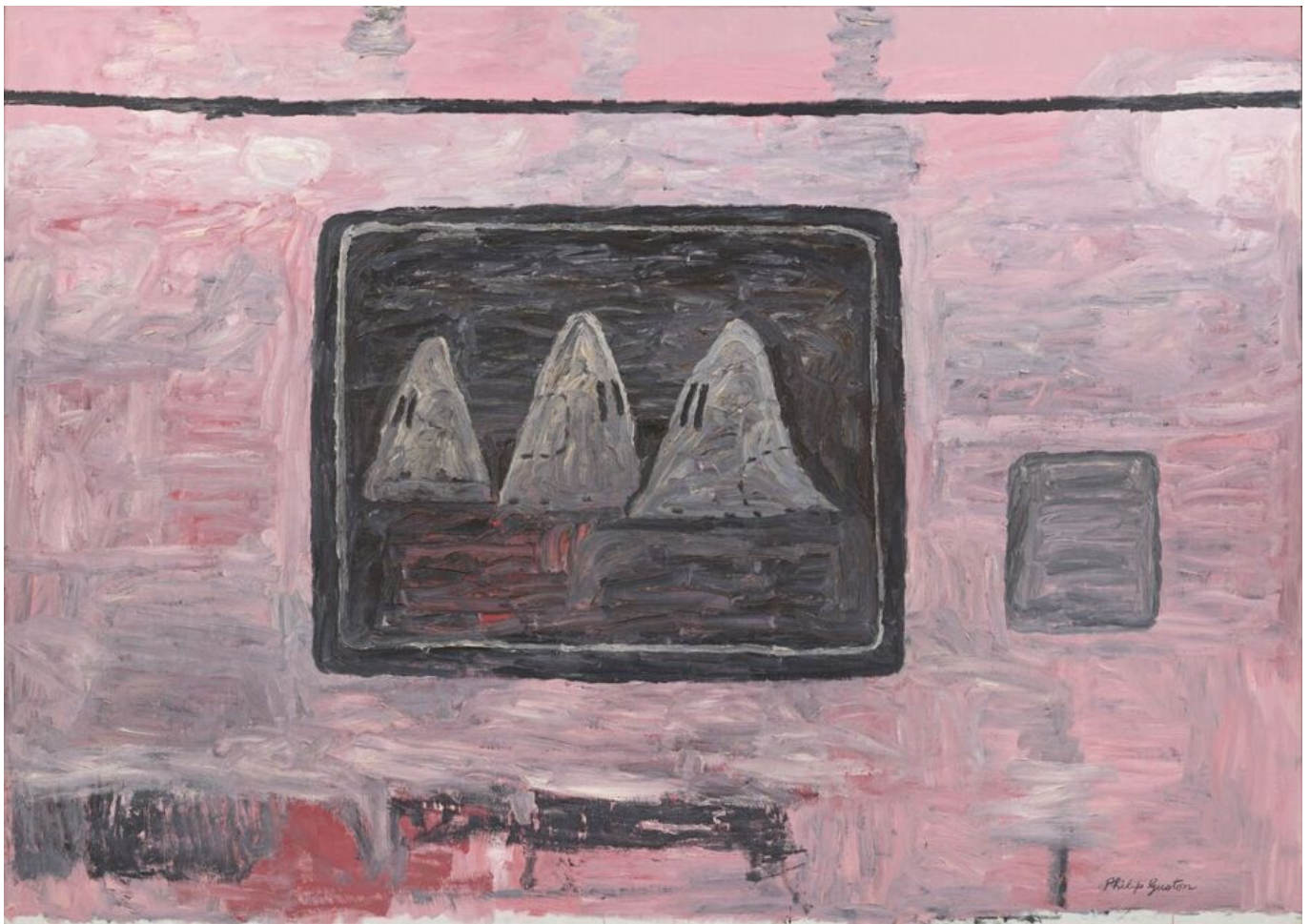
Philip Guston (Canada), Blackboard , 1969.

Next year, 2023, will be the bicentennial of the Monroe Doctrine, when the US asserted its hegemony over the American hemisphere. The malign spirit of the Monroe Doctrine not only continues but has now been extended by the US government into a kind of Global Monroe Doctrine . In order to assert this preposterous claim on the entire planet, the United States has pursued a policy to ‘weaken’ what it sees as ‘near peer rivals’, namely China and Russia.