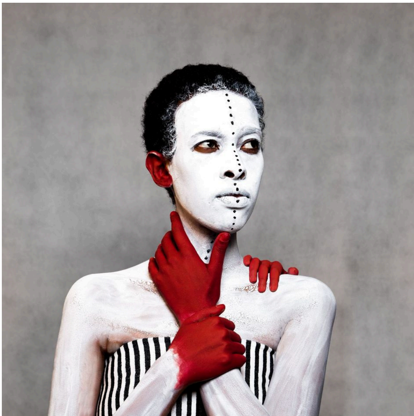
Aida Muluneh (Ethiopia), The 99 Series/Part Two , 2013.

In July 2022, the ILO and World Health Organisation published another report on the pay gap, this time with an emphasis on the health care sector. Their report , The Gender Pay Gap in the Health and Care Sector: A Global Analysis in the Time of COVID-19 , established that, in the health and care sector, women earn on average up to 24 percent less than men. Despite women accounting for 67 percent of the jobs in this sector, only a small number of them work in upper management, and the gap between the wages of hospital administrators and nurses, for instance, only grows wider each year.