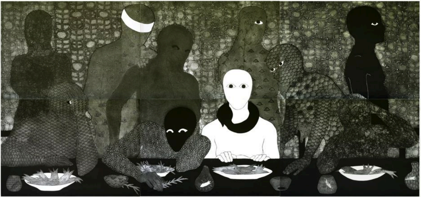
Belkis Ayón (Cuba), La cena ('The Supper'), 1991.

$105 billion (in addition to the – likely underreported – $858-billion military budget for 2023) includes $61.4 billion for the grinding war in Ukraine and $14.1 billion for the Israeli genocide of the Palestinians. Though peace talks opened between Ukrainian and Russian authorities in both Belarus and Turkey days after Russian troops entered Ukraine, these talks were hastily scuttled by NATO, fuelling the conflict that has resulted in nearly 10,000 civilian deaths so far. The civilian death toll in Ukraine during one year and eight months of the conflict has already been surpassed by the civilian death toll in Palestine in merely four weeks.