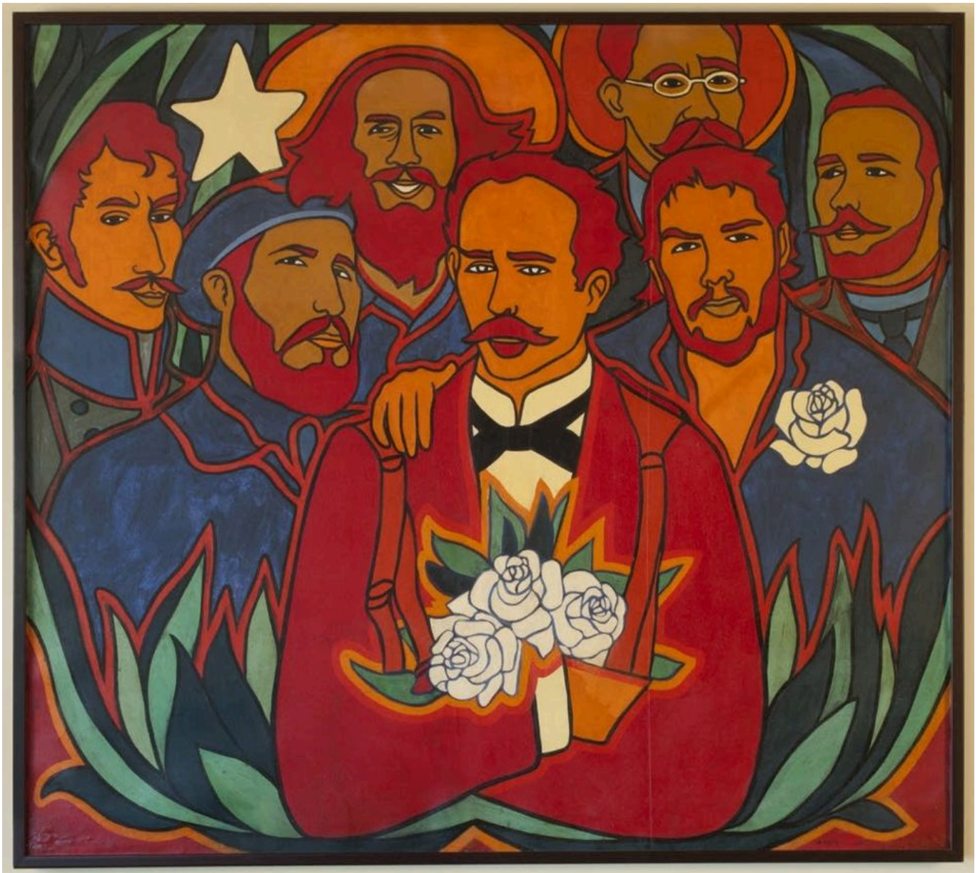
Raúl Martínez (Cuba), Rosas y Estrellas ('Roses and Stars'), 1972.

its Gross Domestic Product on education, while the US spent 5.4%. Not only are all schools free for Cuban children, but all Cuban children receive meals at school and are given their uniforms. Medical education is also free in Cuba, creating a high doctor-to-patient ratio of 8.4 physicians and 7.1 nurses for every 1,000 Cubans. At the UN General Assembly, Cuba's Foreign Minister Bruno Rodríguez Parrilla said that 'attention to the human being has been and will continue to be the priority of the Cuban government'. The blockade might be 'economic warfare', he said, but the Cuban Revolution – which has faced this 'economic siege' for decades – will not wilt. It will stand firm.