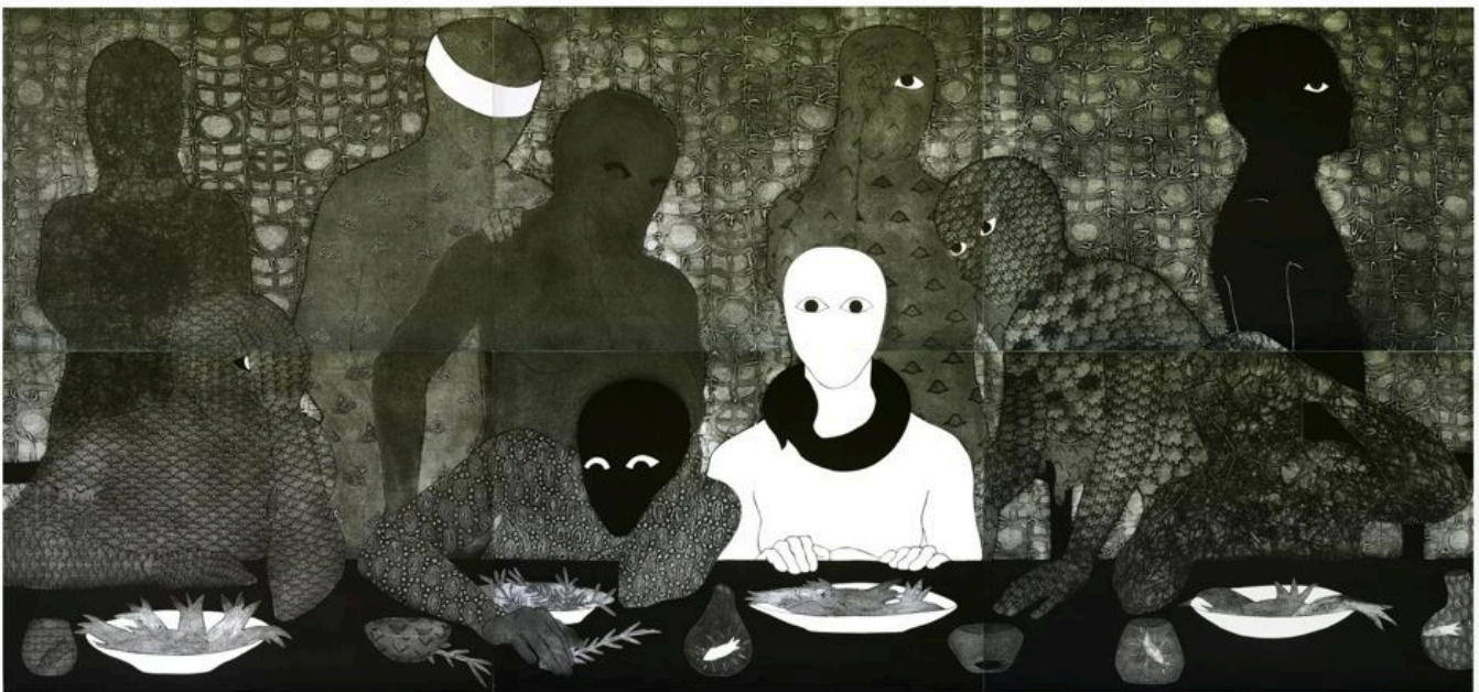
Belkis Ayón (Cuba), La cena ('The Supper'), 1991.

$105 billion (in addition to the – likely underreported – $858-billion military budget for 2023) includes $61.4 billion for the grinding war in Ukraine and $14.1 billion for the Israeli genocide of the Palestinians. Though peace talks opened between Ukrainian and Russian authorities in both Belarus and Turkey days after Russian troops entered Ukraine, these talks were hastily scuttled by NATO, fuelling the conflict that has resulted in nearly 10,000 civilian deaths so far. The civilian death toll in Ukraine during one year and eight months of the conflict has already been surpassed by the civilian death toll in Palestine in merely four weeks.