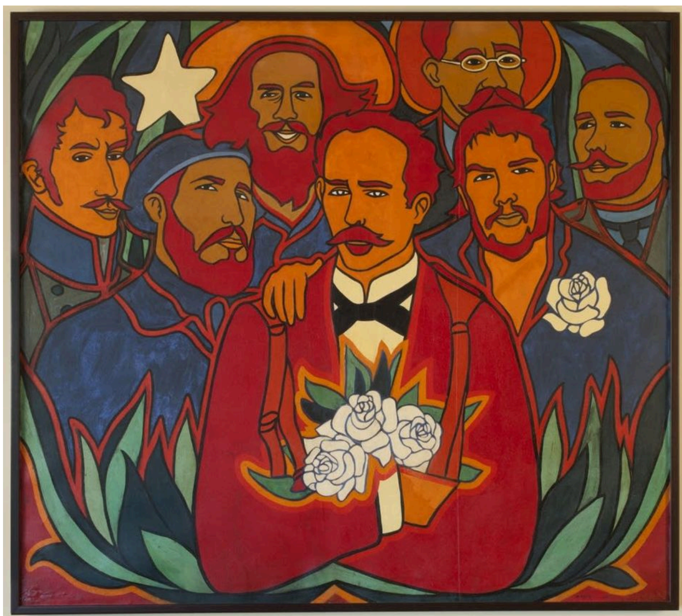
Raúl Martínez (Cuba), Rosas y Estrellas ('Roses and Stars'), 1972.

its Gross Domestic Product on education, while the US spent 5.4%. Not only are all schools free for Cuban children, but all Cuban children receive meals at school and are given their uniforms. Medical education is also free in Cuba, creating a high doctor-to-patient ratio of 8.4 physicians and 7.1 nurses for every 1,000 Cubans. At the UN General Assembly, Cuba's Foreign Minister Bruno Rodríguez Parrilla said that 'attention to the human being has been and will continue to be the priority of the Cuban government'. The blockade might be 'economic warfare', he said, but the Cuban Revolution – which has faced this 'economic siege' for decades – will not wilt. It will stand firm.