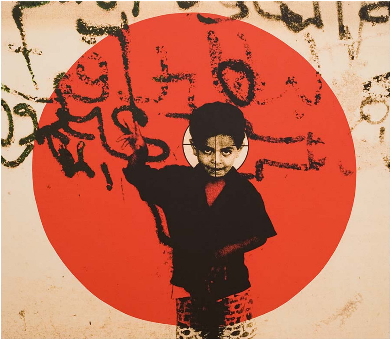
Laila Shawa (Palestine), Target 2009 , 2009.

Even when high-ranking US officials talk about a 'humanitarian pause', they continue to find billions of dollars and more weapons systems for the Israeli military. This idea of a 'humanitarian pause' is legalese that means nothing for the survival of Gazans: the pause would end the bombing for a short period of time, possibly only a few hours, to allow the wounded to be removed and some aid to enter Gaza City before giving Israelis a green light to resume their murderous bombardment. Thus far, Israel has dropped a higher tonnage of explosives on Gaza than the combined weight of the two bombs dropped on Hiroshima and Nagasaki in 1945.