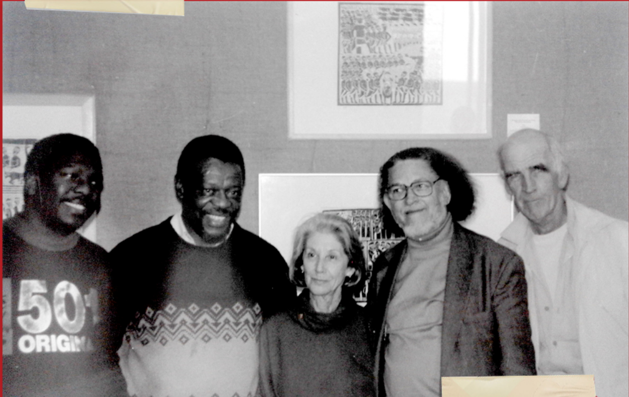
Mongane Wally Serote (second from left), Nadine Gordimer (centre), and Dennis Brutus (second from the right)

South Africa’s poet laureate Mongane Wally Serote underwent ‘conscientisation’ in the Black Consciousness Movement during his school years in Soweto, before he joined the African National Congress. In 1969, Serote was arrested and spent nine months in solitary confinement. He eventually went into exile: first to Botswana, where he joined the uMkhonto weSizwe, the military wing of the ANC, and then formed the Medu Arts Ensemble with Thami Mnyele and others. Later, Serote would go to London to work in the ANC’s Department of Arts and Culture. He returned to South Africa in 1990.