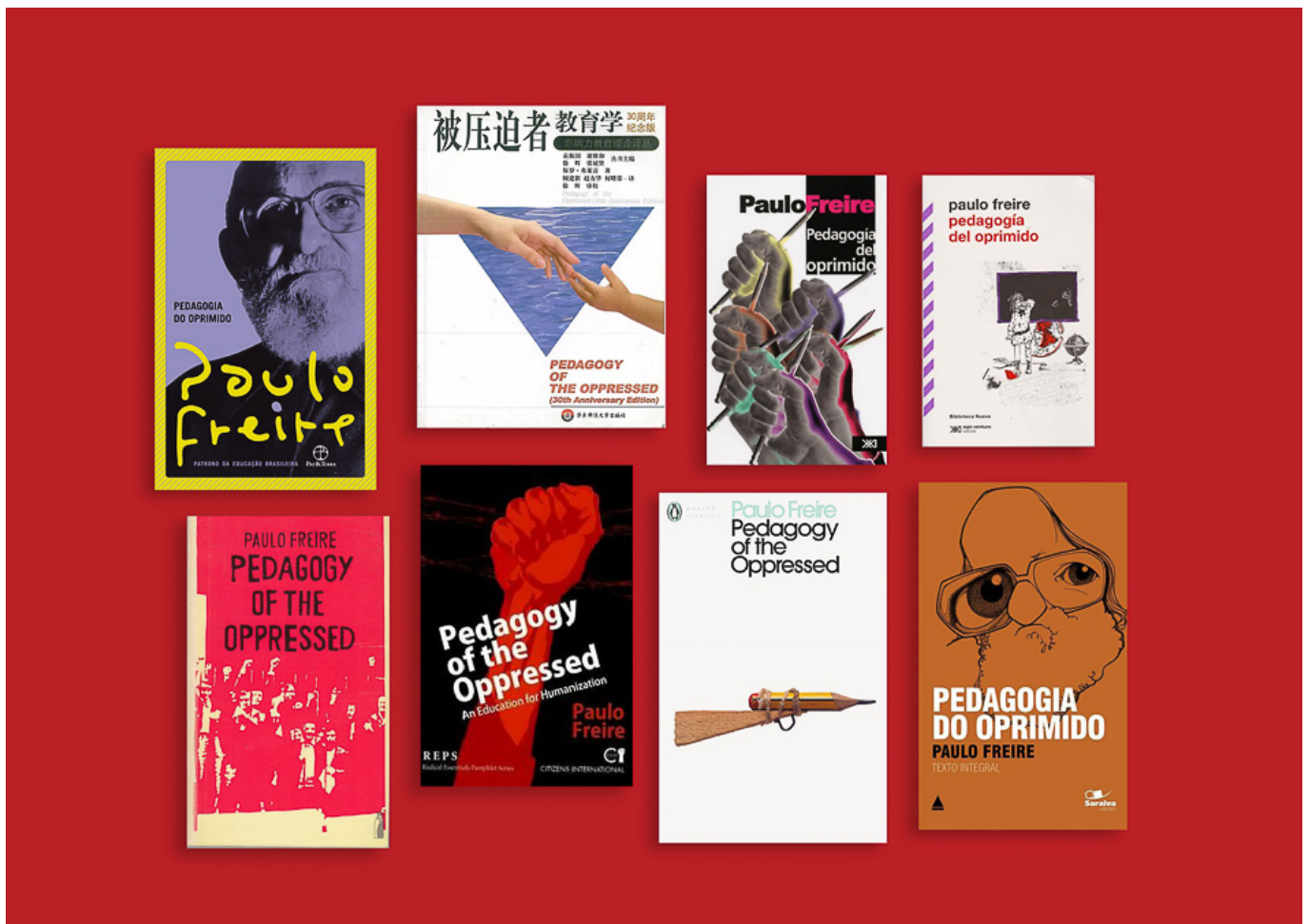
Book covers of Pedagogy of the Oppressed in different languages.

The struggle for dignity is elemental, and it formed a core part of the ideology of national liberation. This was the premise of the work of two thinkers — Frantz Fanon and Paulo Freire — whose writings emerged out of the national liberation and socialist traditions, which impacted those struggles in turn. It is no surprise that our Tricontinental: Institute for Social Research office in Johannesburg (South Africa) has produced two dossiers on these two important figures: Frantz Fanon: The Brightness of Metal in March 2020, and now Paulo Freire and Popular Struggle in South Africa in November 2020. Part of our work in the Institute is to go back to go forward ; to return to the sources of our tradition, study them carefully for their important lessons, and then draw from them in order to advance our struggles in the present. Both Fanon and Freire — the latter influenced by the former’s The Wretched of the Earth (1961) as he drafted his classic Pedagogy of the Oppressed (1968) — emphasised the importance of collective study and struggle as the lever to develop a critical consciousness amongst the masses. Their general orientation towards the integral relationship between collective study and struggle informs our own approach in the Institute, as we laid out in our dossier The New Intellectual in February 2019.