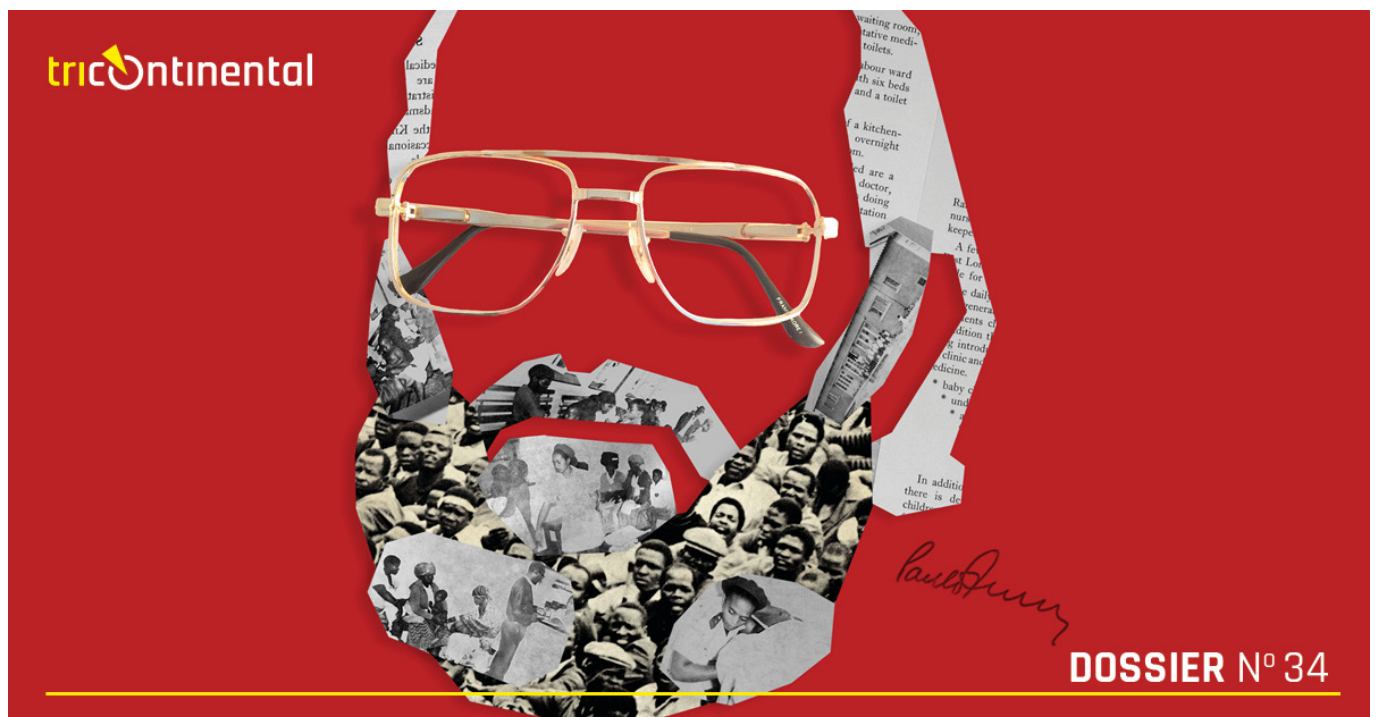
Cover of dossier 34: Paulo Freire and Popular Struggle in South Africa