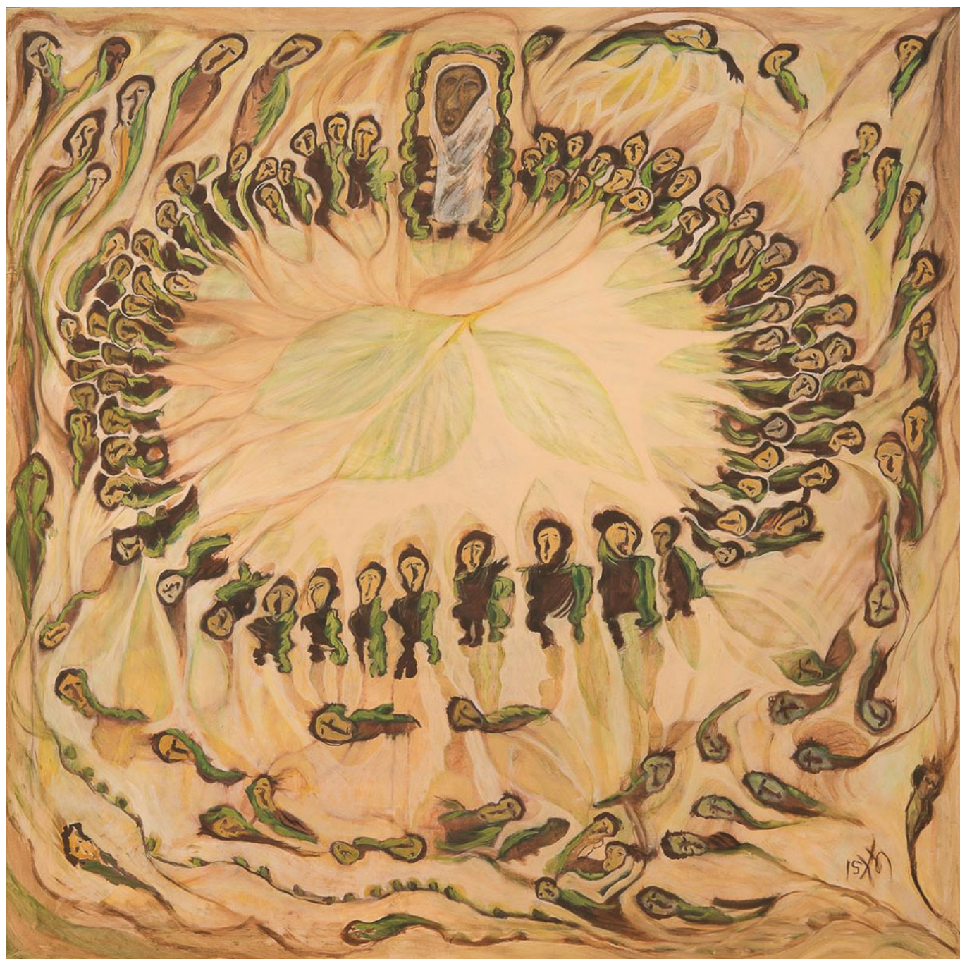
Kamala Ibrahim Ishaq (Sudan), Procession (the Zār) , 2015