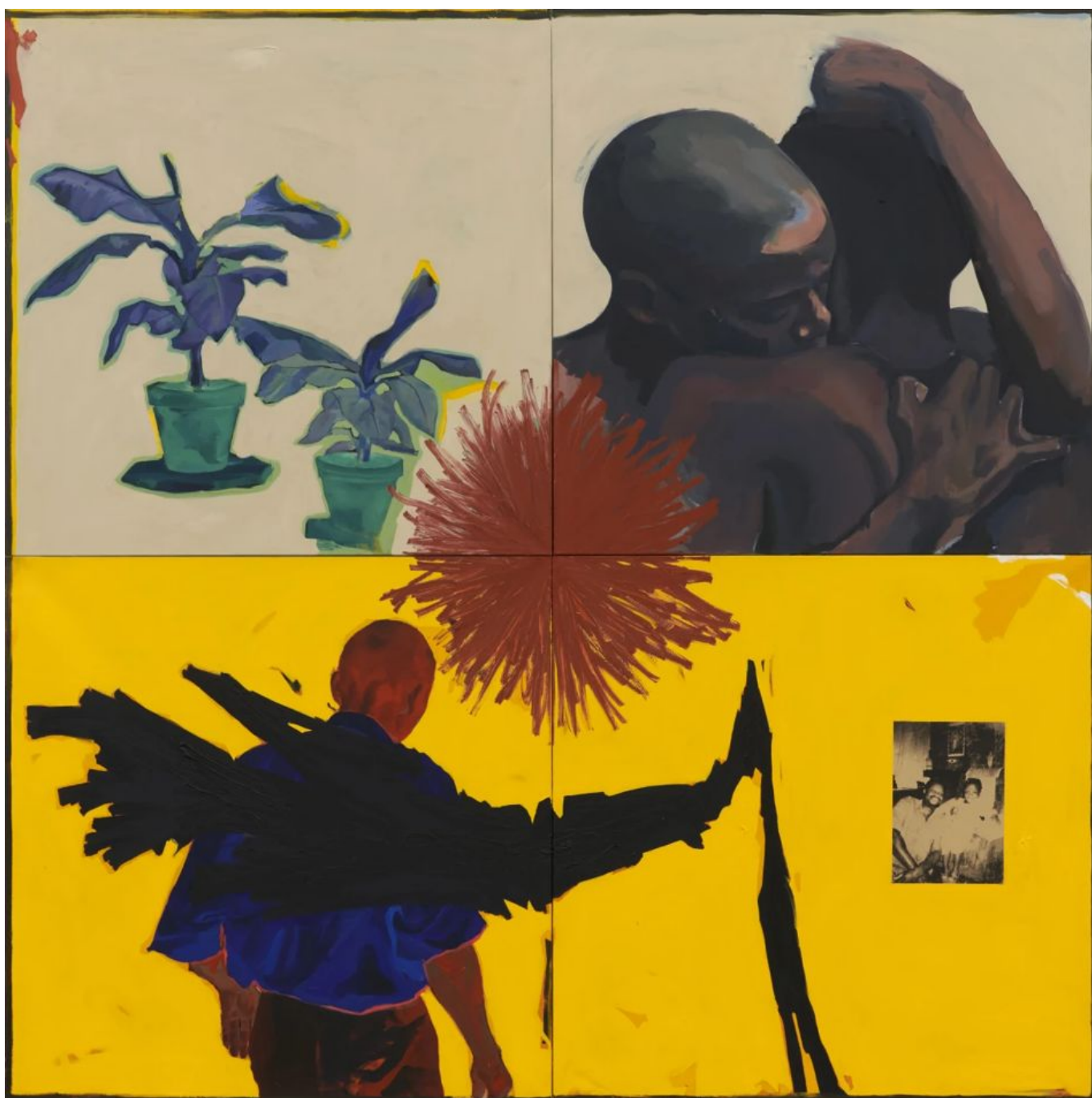
Kudzanai-Violet Hwami (Zimbabwe), A Theory on Adam , 2020.

In dossier no. 31 (August 2020), 'The Politic of Blood': Political Repression in South Africa , we catalogued the political violence that has become commonplace in South Africa. Two paragraphs from that report bear quotation: