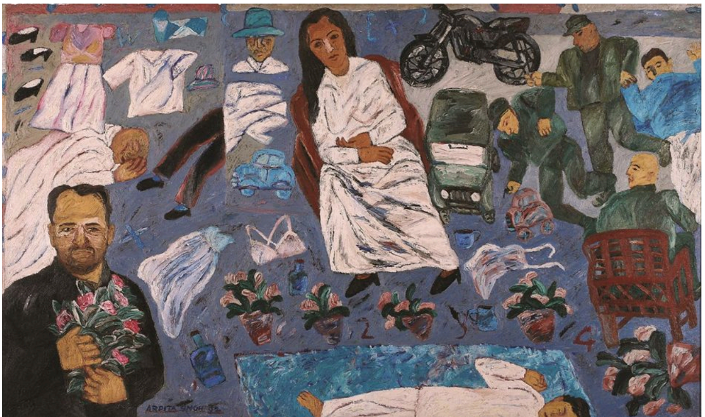
Arpita Singh (India), What Are You Doing Here? 2000.

The Communist Party – CPI(M) – and the media houses had been critical of the BJP-led state government. The CPI(M) and other organisations took to the streets to protest a range of policies; these protests have drawn considerable support from the population. The CPI(M) was a key constituent of the Left Front, which governed the state from 1978 to 1988 and from 1993 to 2018.