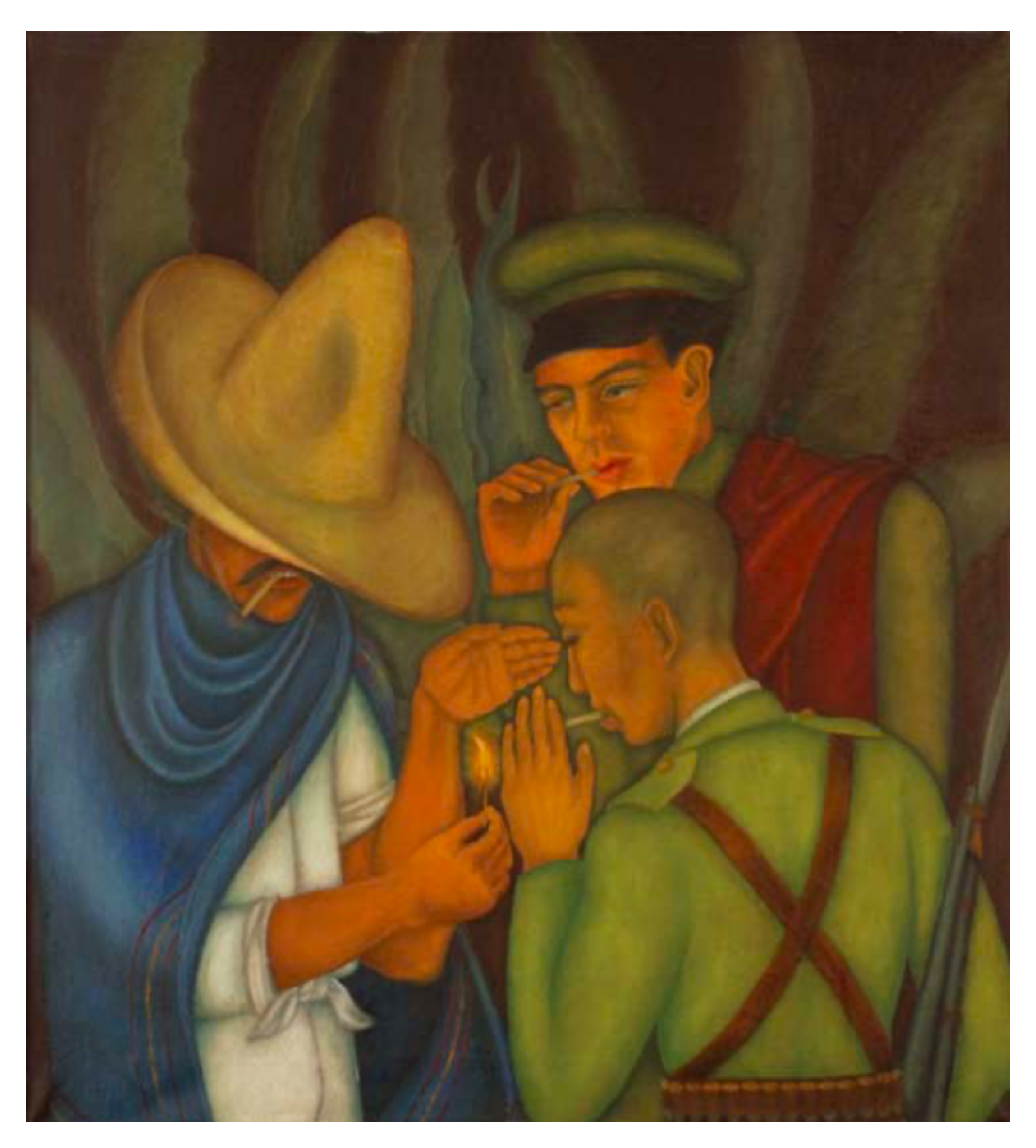
Aurora Reyes Flores (Mexico), Escena revolucionaria , 1935.

Hidden in the shadows of these reports are the realities of women who live in rural areas. In India, for instance, rural women make up 81.29% of the female workforce, but only 12.9% of women hold land. Most of these women are landless agricultural workers or informal sector workers. During the most recent wave of