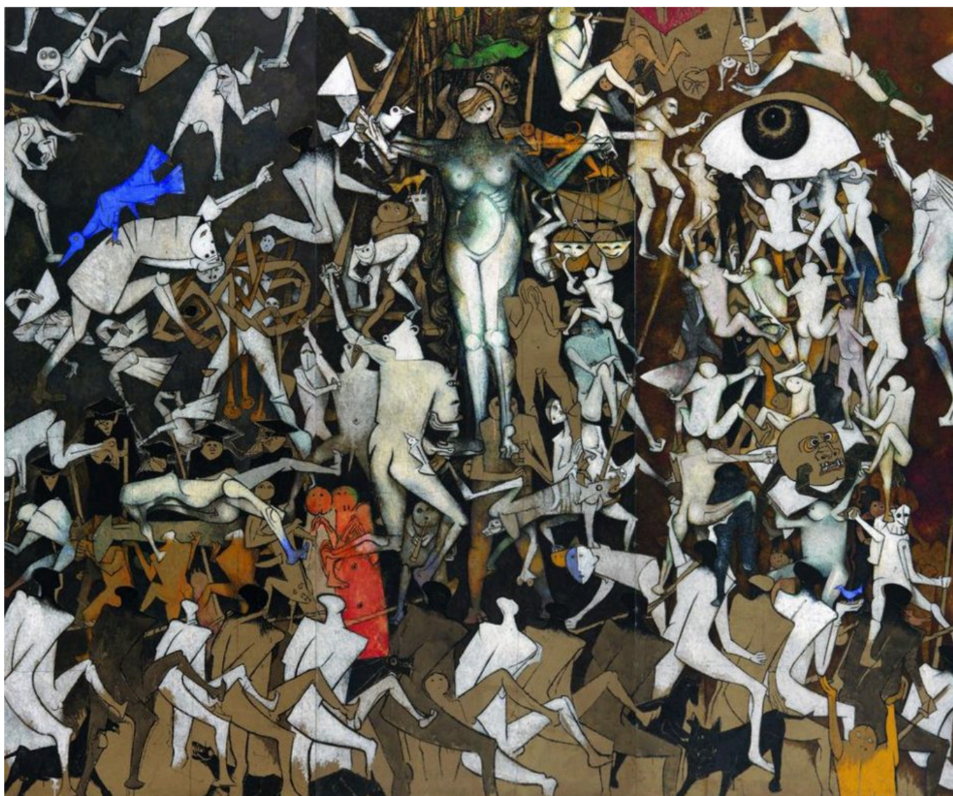
Gerardo Chávez (Peru), La justicia en su laberinto , 2009.

In 2019, the team in Buenos Aires set up the Observatory of the Conjuncture in Latin America and the Caribbean (OBSAL) to produce an analysis of the strategies and policies that confound the region. The OBSAL reports are published every two months. In OBSAL's Report no. 12 (May 2021), for instance, the researchers travel from the massive protests and crackdown in Colombia to the elections for a new constituent assembly in Chile. There is no better place to get a handle on the density of events that reveal – after analysis – the structural tendencies at work in the continent.