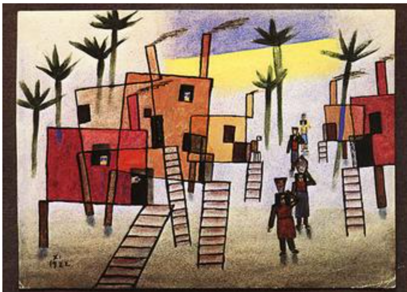
Xul Solar (Argentina), Casas en alto , 1922.

Nothing here will be alien to readers in South America or in South Asia, in Papua New Guinea or in Equatorial Guinea.